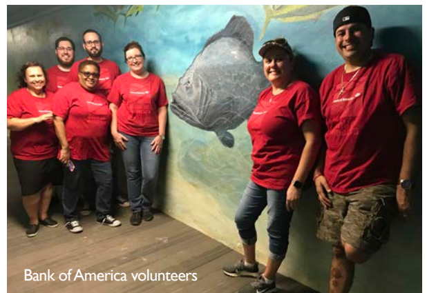
Bank of America volunteers