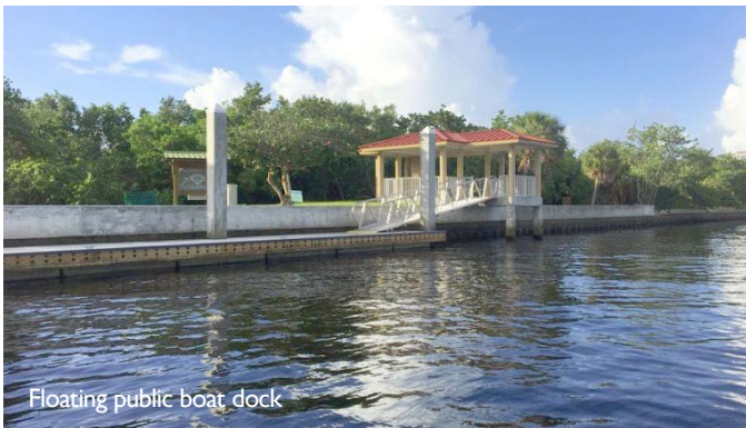
Floating public boat dock

We invite all the boaters to visit our new floating boat dock along the Intracoastal Waterway seawall at the park. In addition to the park being a Water Taxi stop, boats up to 30 feet will now be able to dock at the park for a $2 donation from 8 a.m. until dusk.