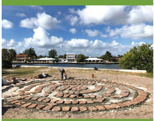
The labyrinth at Marti's Meditation Garden is now under construction. Landscaping and stone benches coming soon.